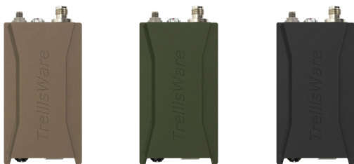
The TW-860 is offered in three color options

Interoperable with all TSM enabled radios, the TW-860 TSM Spirit radio supports a true flat network with massive scalability in a single radio frequency (RF) channel, while still delivering rapid position location information (PLI) updates for every radio.